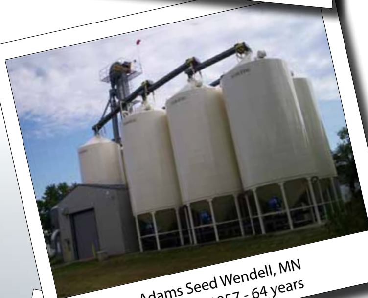
Adams Seed Wendell, MN Started in 1957 - 64 years