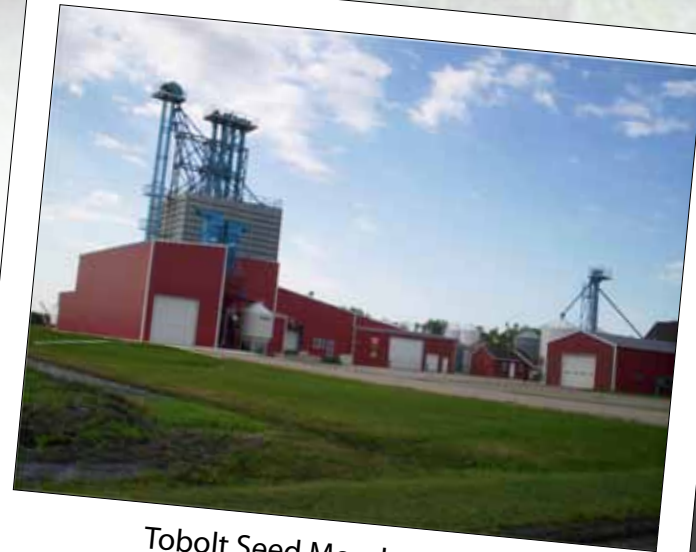
Tobolt Seed Moorhead, MN Started in 1929 - 82 years

ALWAYS READ AND FOLLOW PESTICIDE LABEL DIRECTIONS. Roundup Ready® crops contain genes that confer tolerance to glyphosate, the active ingredient in Roundup® brand agricultural herbicides. Roundup® brand agricultural herbicides will kill crops that are not tolerant to glyphosate. Genuity and Design®, Genuity Icons, Roundup Ready 2 Yield®, Roundup Ready®, and Roundup® are trademarks of Monsanto Technology LLC, Monsanto Canada, Inc. licensee. ©2011 Monsanto Canada, Inc.